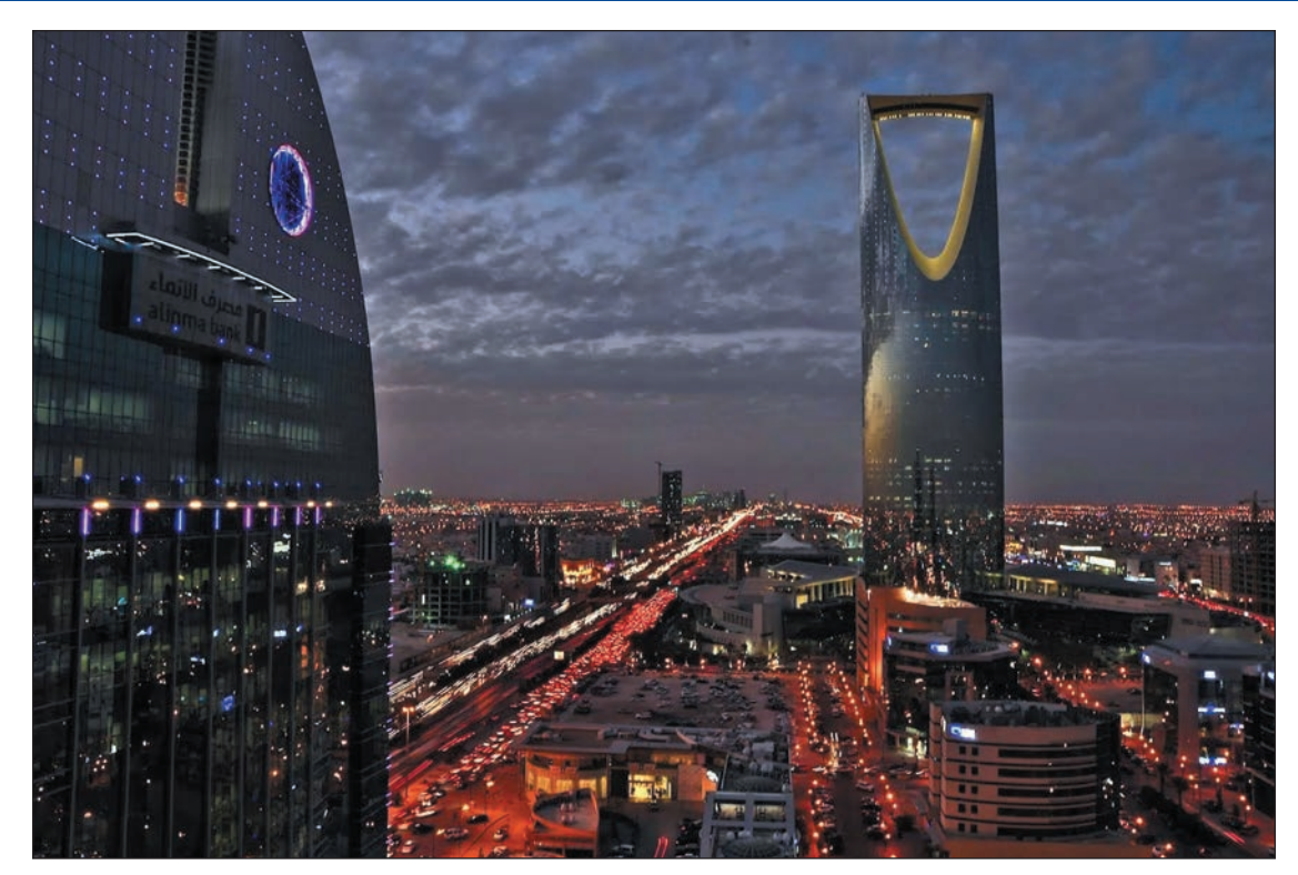
Riyadh, the capital of Saudi Arabia

In 2016, with the launch of the Crown Prince's Vision 2030, our national transformation program, I answered the call to public service and began as Vice President of Women's Affairs at the Saudi General Sports Authority. I was so fortunate to join public service at a time of so much positive momentum. I focused