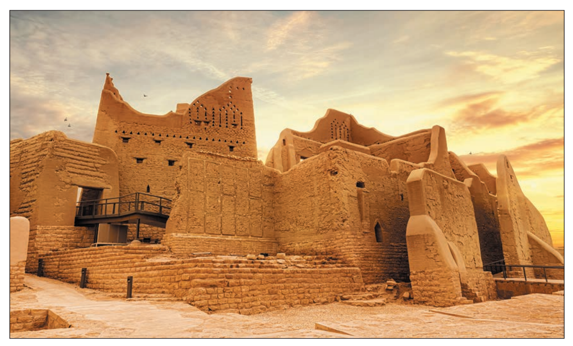
Salwa Palace at Diriyah's At-Turaif UNESCO World Heritage Site

Saudi Arabia stands at the crossroads of Europe, Asia, and Africa – at the heart of global trade and in a part of the world blessed by natural resources. Beyond petroleum, we offer major sources of critical minerals from tin to tantalum of which we have about a quarter of the world's reserves – and that is only the beginning. Entire new sectors are taking flight including tourism, entertainment, sports, and more. Saudi Arabia is expanding and growing sustainably in many directions and fast.