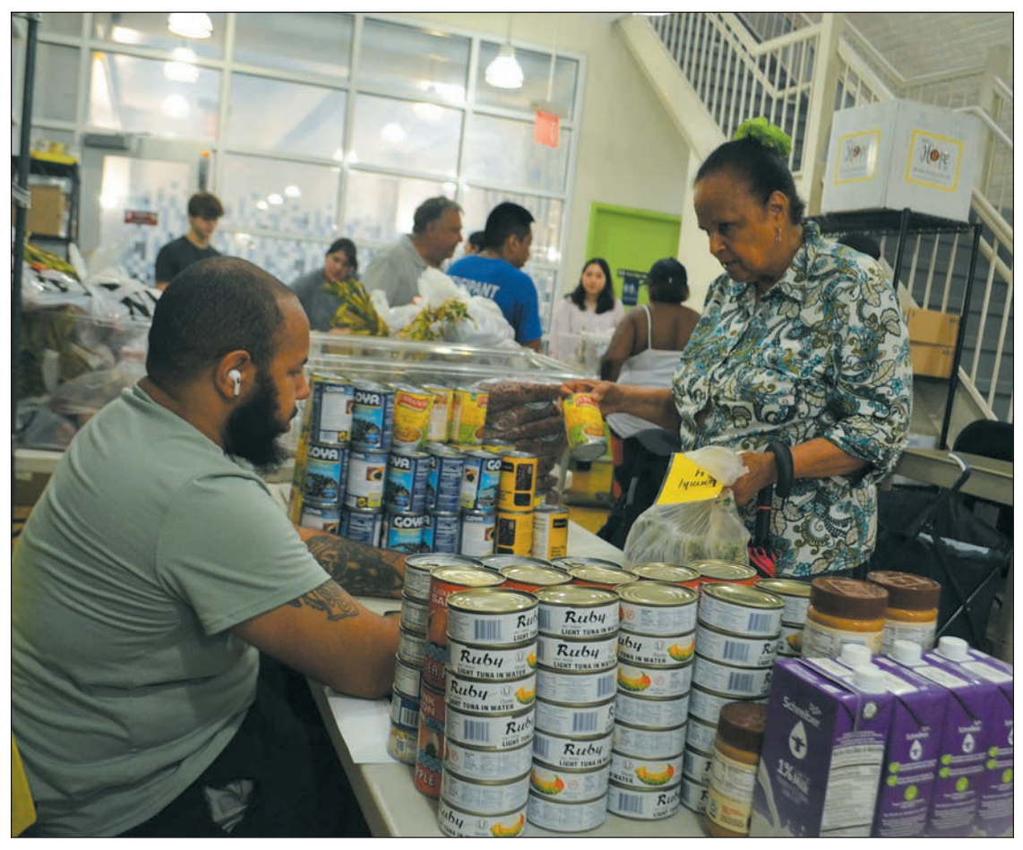
A BronxWorks food pantry, serving Bronx residents in need

agency that provides an array of programs to our Bronx neighbors. Most of our program participants live at or below the poverty line. We provide enriching opportunities for growth for people in every stage of their lives. We maintain a network of low-threshold safe haven programs for the unhoused; we support people and families in achieving permanent and affordable housing; we provide skills and career development; we address food insecurity in the borough to improve health outcomes; we provide childcare and after-school programs for children and youth; we provide adult education and literacy classes for non-English speakers; and we offer no-cost legal assistance for housing cases, immigration, and domestic violence. In addition, BronxWorks is committed to addressing the health disparities in the borough and offers nutrition and wellness through our community health initiatives. We also provide emergency food, programs for older adults, and college search and prep for young adults. It would be impossible to name the multitude of programs and services we offer. We strive to be a place where our neighbors can learn how to address challenges they are facing. Many of our resolute staff are bilingual so we can ensure there is always someone on our team who can communicate with the diverse populations we serve.