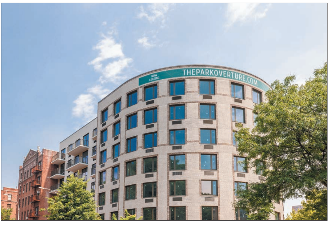
The Park Overture is among the first electric residential buildings in Upper Manhattan

One of the defining characteristics of Baron Property Group is also something that