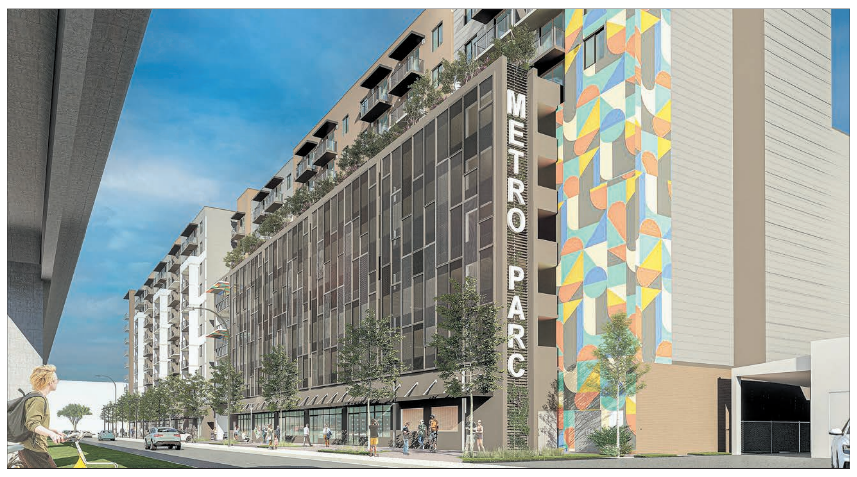
Baron Property Group is currently building Metro Parc, the first phase of its 2.3-million-square-foot mixed-use development in Hialeah, Florida (above); The Park Overture brings well-designed, full-service rental bomes and park-side living to Washington Heights (below)

sets us apart from our competition: our focus on emerging markets. We identify fast-growing, transit-oriented neighborhoods throughout the country that have, for the most part, largely been ignored by developers. We see the opportunities to strategically introduce quality rental housing to these markets, like Hialeah and Long Island City.