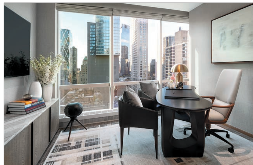
Clockwise from below: Manhattan Suite office, dining room, living area, kitchen; Opposite page - Clockwise from upper left: reading area, bedroom sitting area, bedroom