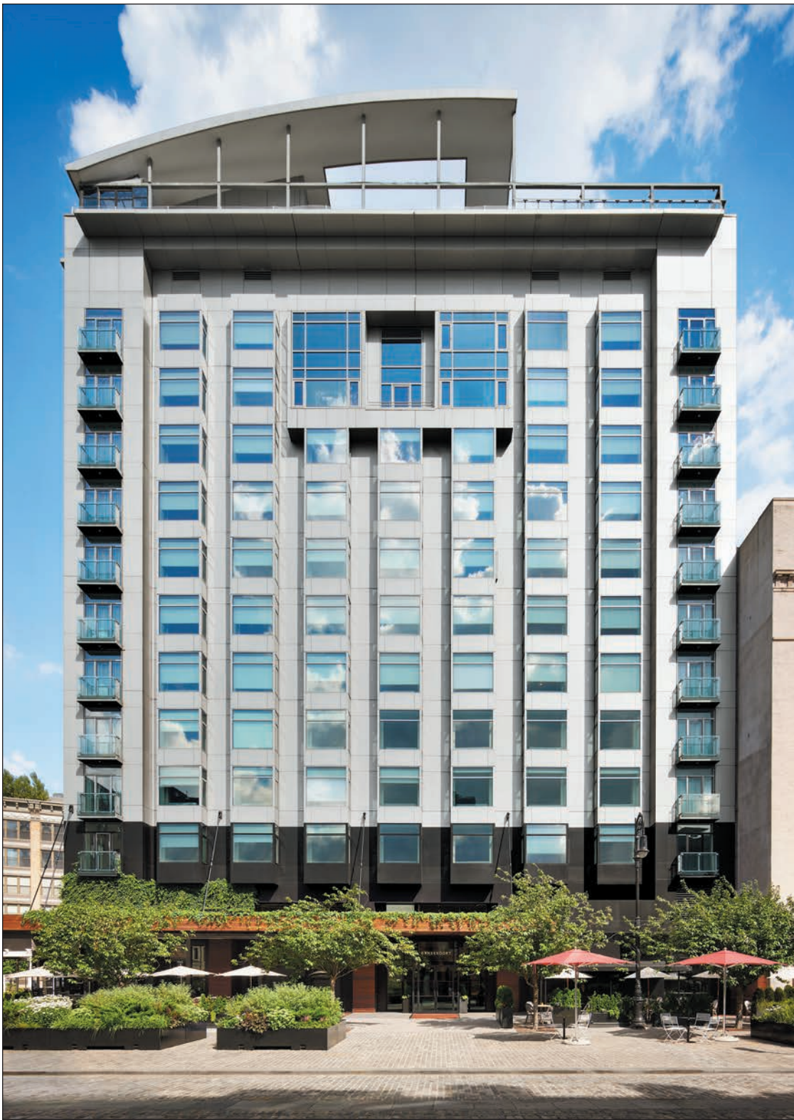
Gansevoort Meatpacking NYC exterior