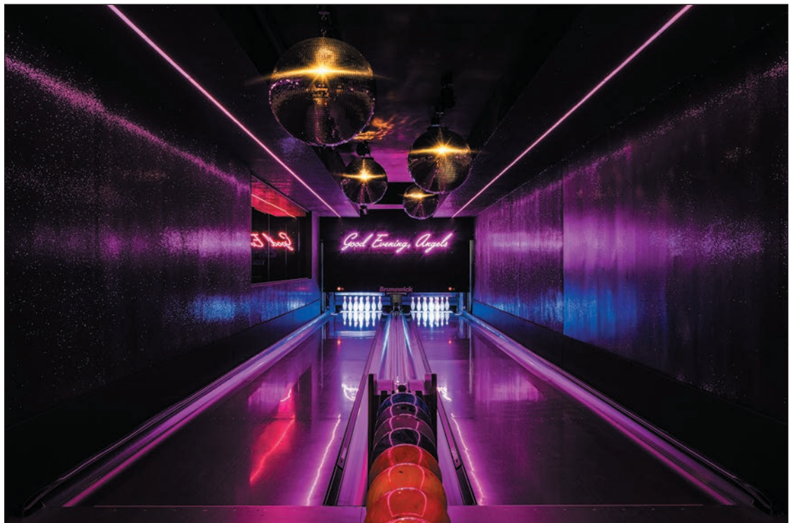
Bowling lanes at Seven24 Collective

At Seven24 Collective ( seven24collective.com ), style, sophistication, and community coalesce. Nestled in the heart of New York's iconic Meatpacking District, its memberships are at the forefront of emerging technology, fashion, and culture. Featuring world-class amenities, Seven24 Collective provides a private and luxurious environment to connect, entertain, work, dine, and relax.