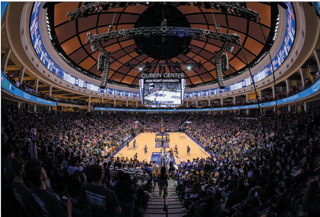
HPU's men's basketball team competing at Qubein Center