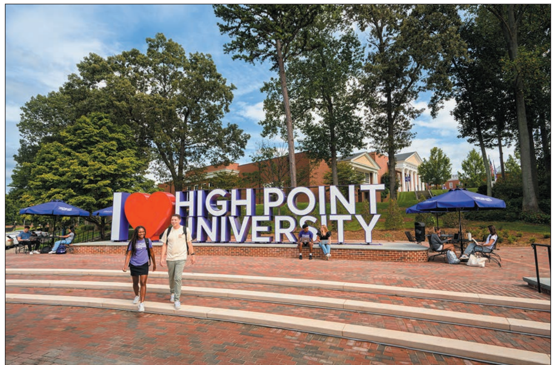
High Point University

I came to this country seeking an education and got it. First, in my formal schooling;