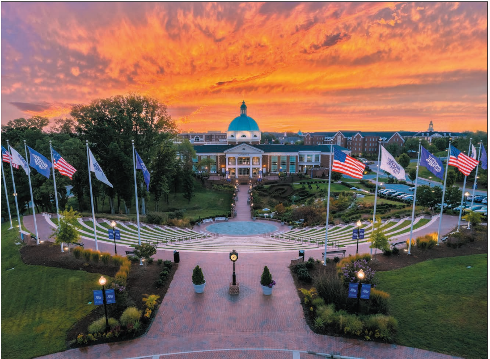
HPU is ranked #9 Best Career Services in the nation by The Princeton Review. Cottrell Hall, pictured here, serves as a center for professional development on campus and houses HPU's Office of Career and Professional Development, Entrepreneurship Center, Office of Undergraduate Research and Creative Works, and much more.

second, from the people and the culture; and third, through my own experiences in business. In my adopted home, I discovered what I have come to believe is the greatest education in the world: creating business ventures from nothing but seeds of clear ideas and strong principles planted in the good soil of American possibility.