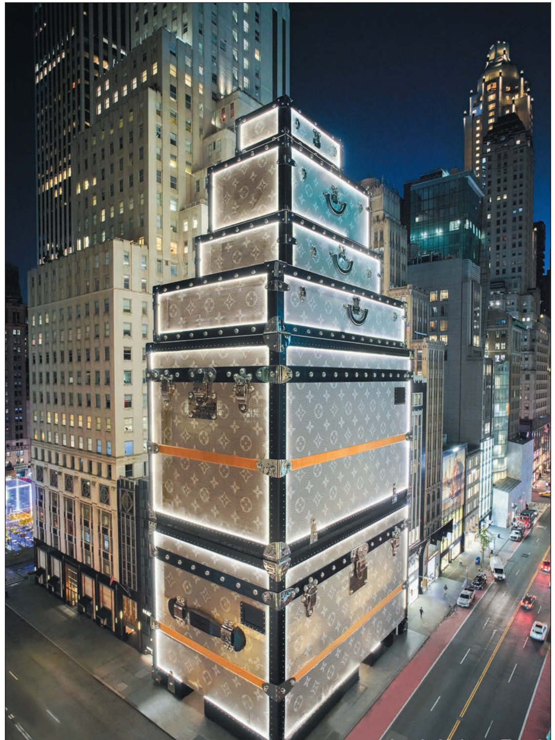
Louis Vuitton Trunks

I would call my management style fair, but firm. We have demanding clients, and it is our responsibility to meet those demands. I try to make the meeting of these demands – to the extent possible – fun. “Work Hard, Play Hard” is one of our core values.