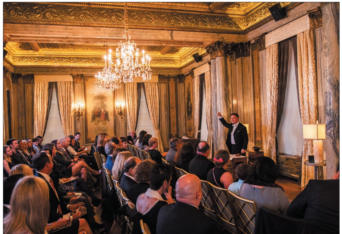
Steve Cohen Chamber Magic poster (top) and performances (this and following pages)

luxurious hotel in Asia; the Park Hyatt Tokyo. Since much of my performance relies on spontaneity it required a solid command of Japanese to ad-lib in a foreign language. As a result of meeting a steady stream of high-level clients at the hotel, I was invited to entertain at private events all around Tokyo. That was my initial business model, and, in fact, I continued with that format when I moved back to New York. The problem with one-night contracts is that you are always unemployed until your next