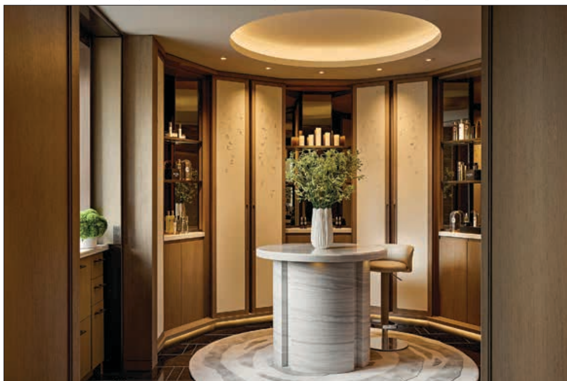
Spa Nalai reception

Our suite collection is one of the most impressive in the city. With some of the largest entry-level suites in Manhattan, guests enjoy spacious layouts, stunning city views, and an