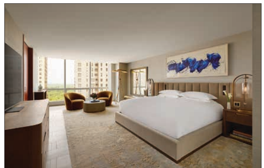
Royal Suite bedroom