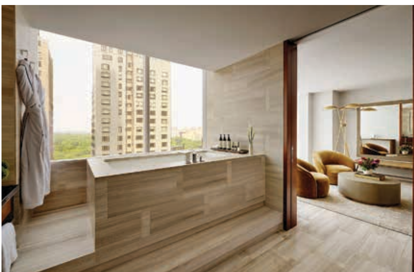
Royal Suite bathroom and sitting area overlooking Central Park

For me, hospitality is about human connection. It's the ability to make someone's day better – whether through a warm welcome, a small surprise, or creating memories that last a lifetime. I've had the privilege to work across continents and cultures, but the core remains the same: service, kindness, and authenticity. ●