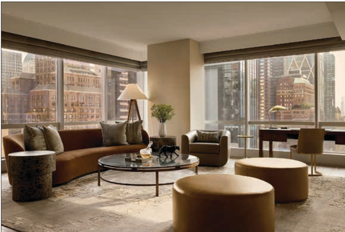
Carnegie Suite living room