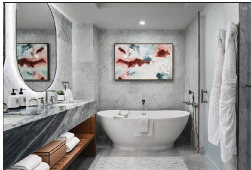
Four Seasons Hotel Washington, DC has recently added ten spacious suites