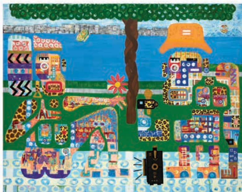
Episode 7OR : "First Date."

Like the legacies of perseverance symbolized in the vintage photos I mentioned earlier, if my legacy can reflect how I've used my "superpowers" – to be blessed and to be a blessing to others, just like my mother – then what a blessing that would truly be. ●