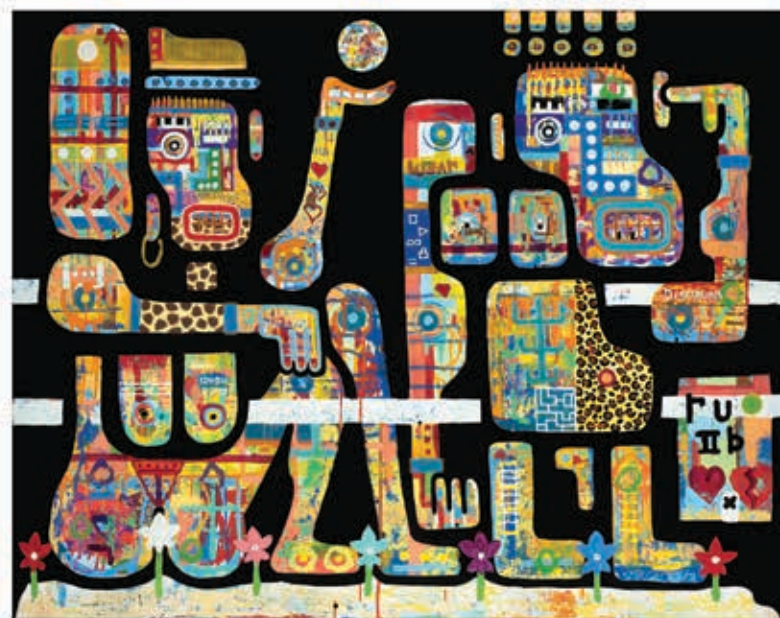
Episode TR3 : "Instant Connection."

One of my favorite activities is visiting the park and grounding myself for at least ten minutes. This practice fosters a connection and communication that goes beyond words. Even when I travel, I seek out parks, beaches, or trees to meditate and reconnect. Travel deeply influences