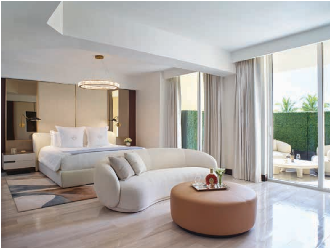
Villa Suite bedroom

upholstered in alabaster bouclé, paired with Italian-sourced Castalia Collection coffee tables, a Casa Dio console, and a Restoration Hardware rug. Accent lighting from Rejuvenation and Revelite, and drapery in fabrics by Fabricut and P/K Contract, enhance the refined ambiance. Playful touches such as abstract artwork by Domenica Brockman and wallcovering - including Innovations Pintuck wallpaper and a striking Philip Jeffries Terra Tones accent wall - add character and texture, while staying true to the suite's sophisticated design ethos. Other decorative details include handcrafted SKLO Taper Vessel vases, Imperial Glass vases, and a curated collection of designer books that enhance the residential feel.