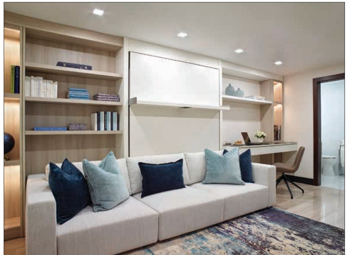
Villa Suite den murphy bed