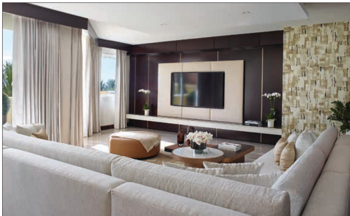
Villa Suite living room (above) and terrace (top right)